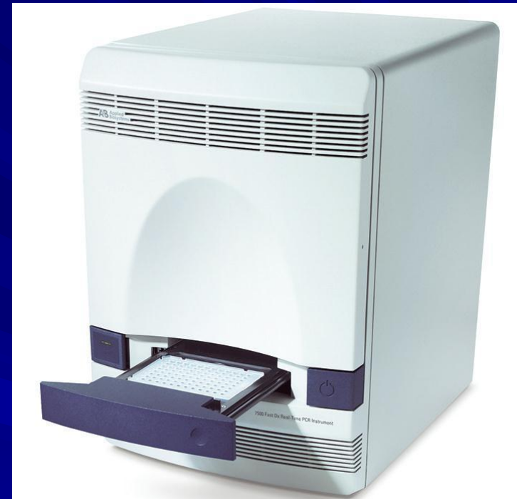
ABI 7500 Fast Dx PCR System